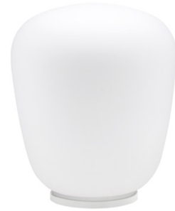
Table lamp with diffuser in satin-finish white blown glass. Supporting structure made of metal or polyester reinforced with glass fibre, painted white.