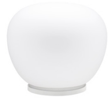
Table lamp with diffuser in satin-finish white blown glass. Supporting structure made of metal or polyester reinforced with glass fibre, painted white.