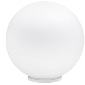
Table lamp with diffuser in satin-finish white blown glass. Supporting structure made of metal or polyester reinforced with glass fibre, painted white.